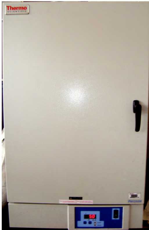
Figure 2: Oven set to 50 to 60 degrees C for drying out the collected sample placed in Pyrex dishes