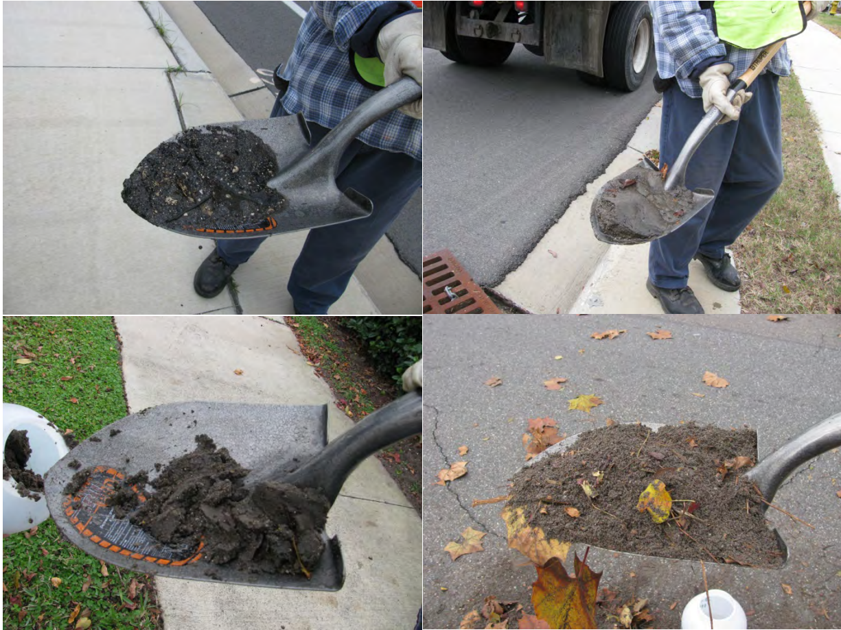
Figure 1: Visual indication of moisture content variability that can be observed in collected samples of solids that have been recovered during the MS4 study (can vary from dry to wet (top left))