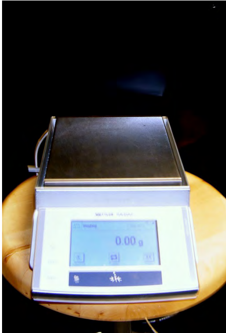
Figure 5: Top-loading weighing scale ('zero' scale before using)