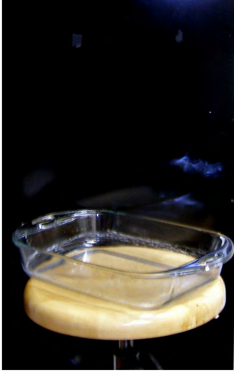
Figure 3: Pyrex baking dish for drying collected sample (clean and dry before pouring in sample)